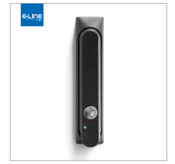
Mechatronic locking solutions